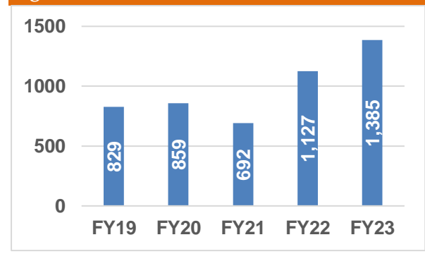
Figure 2: EBITDA & EBITDA Margin Trend